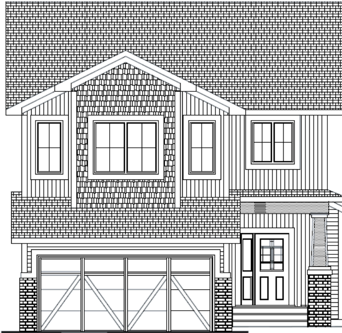
11 Baywater Court / 2124 sq.ft. Two Storey